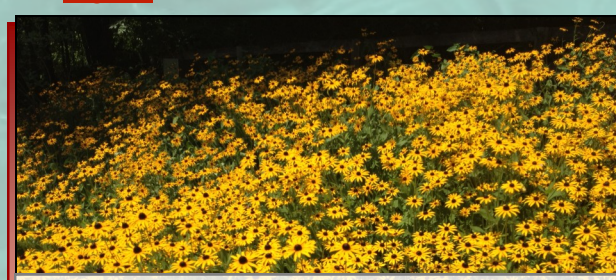
The native Black-eyed Susan (Rudbeckia hirta), Maryland's State Flower, is an excellent nectar source. Blooming June–October, it offers food to honey bees and other pollinators when the overall nectar flow is low.